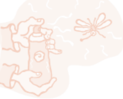
When you're outside during mosquito season, health experts recommend using repellent.