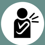
Injection site pain