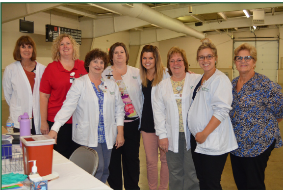
Richland Public Health Nurses used one of the Flu Shot Clinics as a test of Emergency Preparedness.

Richland Public Health is always planning for the next public health threat. Through our Emergency Planning and Preparedness , Richland Public Health has created an experienced staff that is capable of planning, training, exercising, and leading a response within the community and coordinating the efforts with local, regional, and state partners. We plan for all hazards, including disease outbreaks.