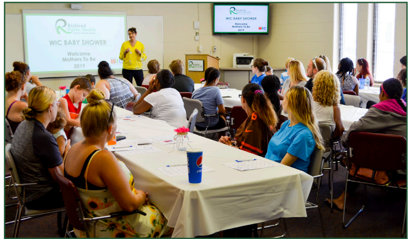
WIC New Mothers-To-Be Baby Shower featured WIC Dietitians and Public Health Nurses as speakers. WIC classes for clients and their children take place throughout the year.