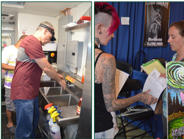
"Inkcarceration" at the historic Ohio State Reformatory becomes one of the biggest tattoo and heavy metal events in the nation. Environmental Health sanitarians inspect food vendors as well as inspect and register tattoo artists who come from around the world.