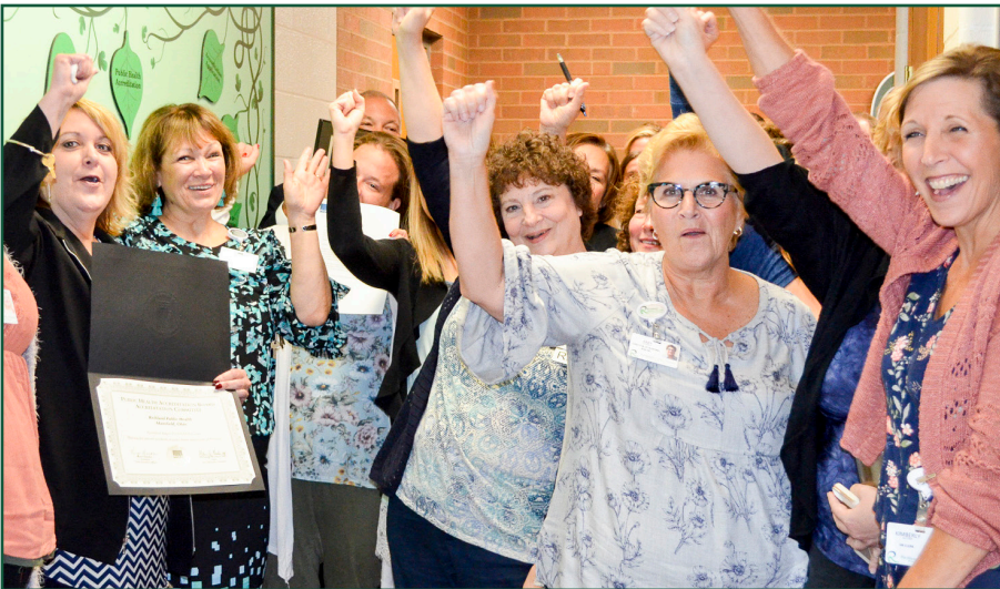
Richland Public Health staff celebrate the PHAB announcement while pinning the last "leaf" in place on our big accreditation process board in the East Wing hallway.

Achieving PHAB accreditation also means Richland Public Health immediately started work on re-accreditation, a three-year process toward continued excellence.