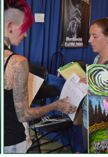
"Inkcarceration" at the historic Ohio State Reformatory becomes one of the biggest tattoo and heavy metal events in the nation. Environmental Health sanitarians inspect food vendors as well as inspect and register tattoo artists who come from around the world.