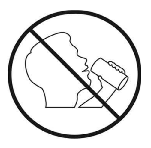
FIGURE 608.8.1 PICTOGRAPH—DO NOT DRINK

The words shall be legibly and indelibly printed on a tag or sign constructed of corrosion-resistant waterproof material or shall be indelibly printed on the fixture. The letters of the words shall be not less than 0.5 inch (12.7 mm) in height and in colors in contrast to the background on which they are applied. In addition to the required wordage, the pictograph shown in Figure 608.8.1 shall appear on the required signage.