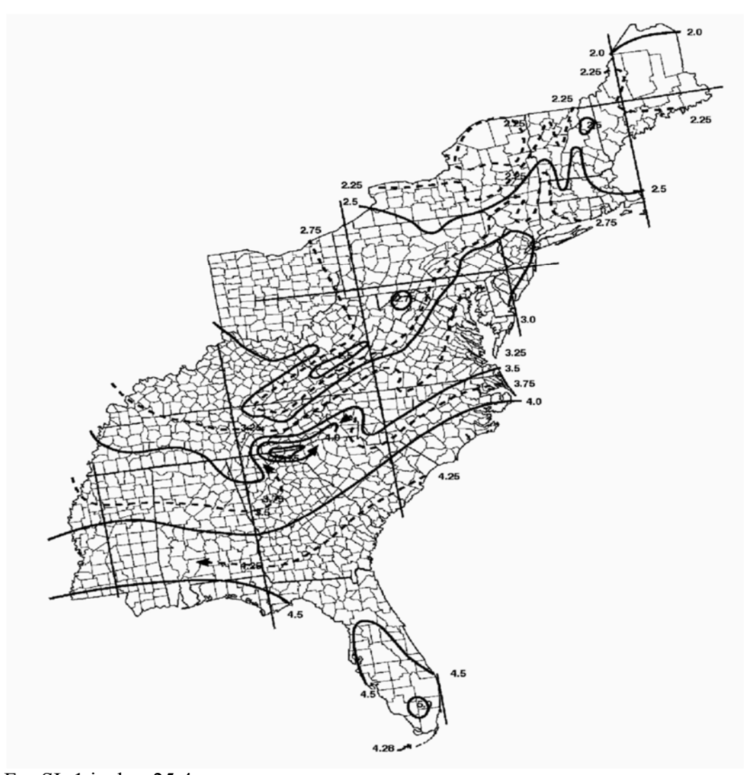
1106.1 General. The size of the vertical conductors and leaders, building storm drains, and any horizontal branches of such drains shall be based on the 100-year hourly rainfall rate indicated in Figure 1106.1 or on other rainfall rates determined from approved local weather data.