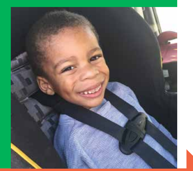
Through the "Ohio Buckles Buckeyes" program, Richland Public Health can provide FREE car seats.