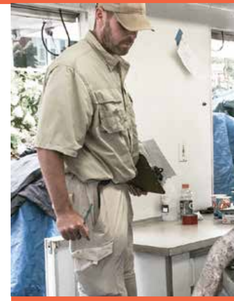
Food service inspections include mobile units at county and community fairs by our sanitarians.