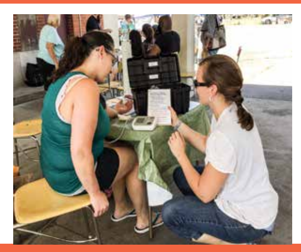
Nursing students from North Central State College demonstrate how to use the Blood Pressure Cuffs.