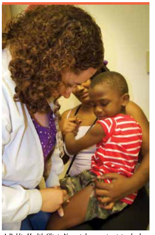
\label{lem:condition} A\ Public\ Health\ Clinic\ Nurse\ takes\ care\ in\ giving\ backto-school\ immunizations\ to\ a\ brave\ young\ patient.